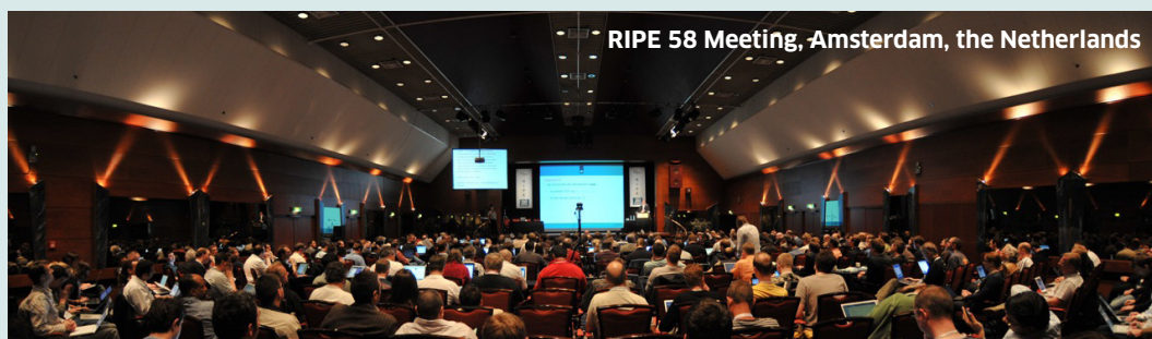
RIPE 58 Meeting, Amsterdam, the Netherlands