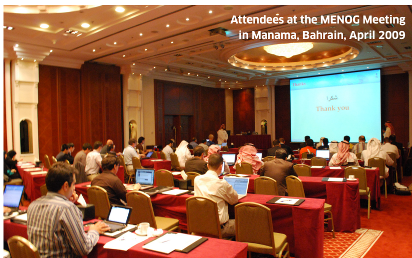
Attendees at the MENOG Meeting in Manama, Bahrain, April 2009

Attracting more than 90 attendees from more than 15 countries, MENOG 4 was a successful event bringing together regional network