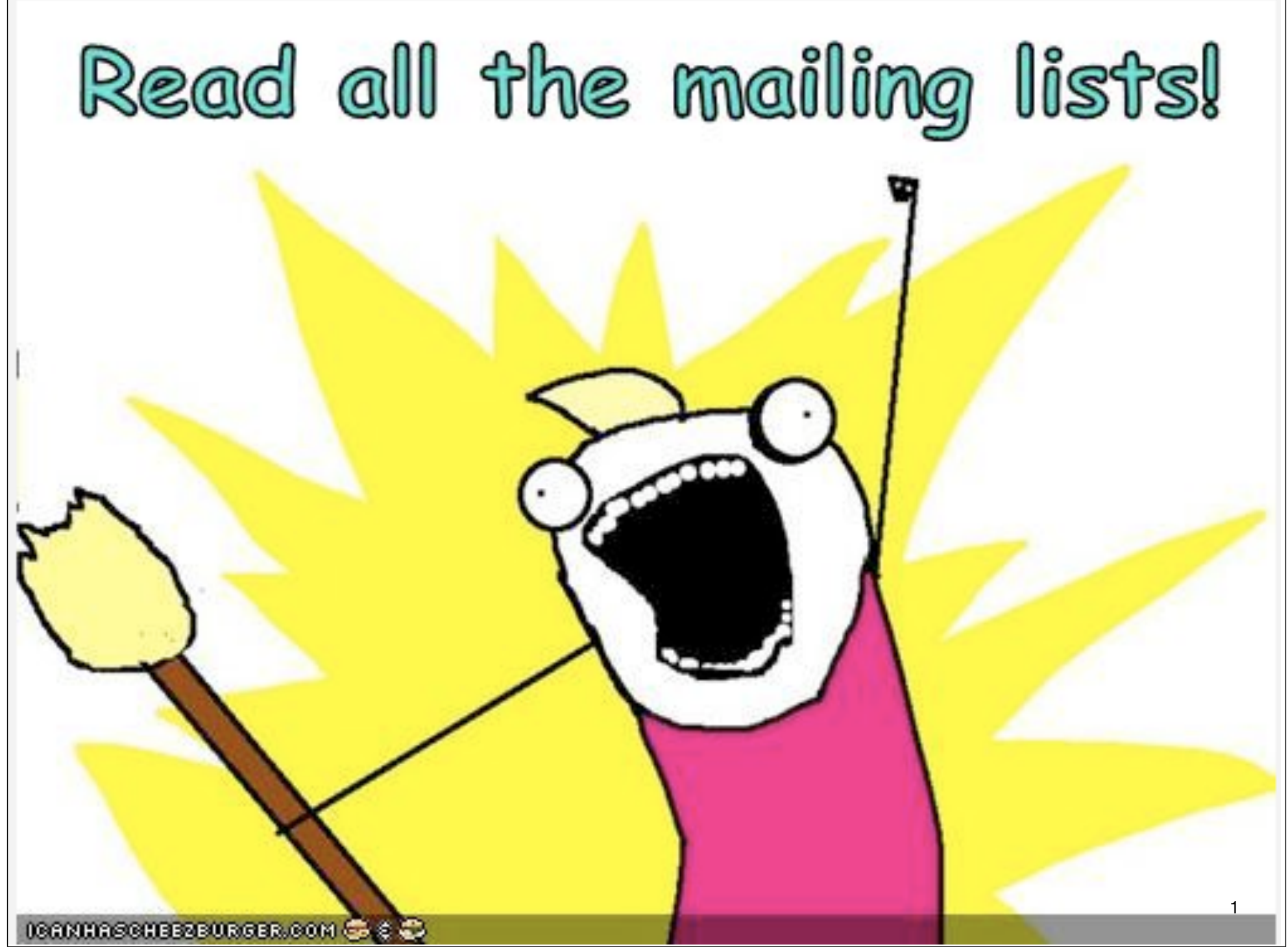
Thursday, August 1, 2013