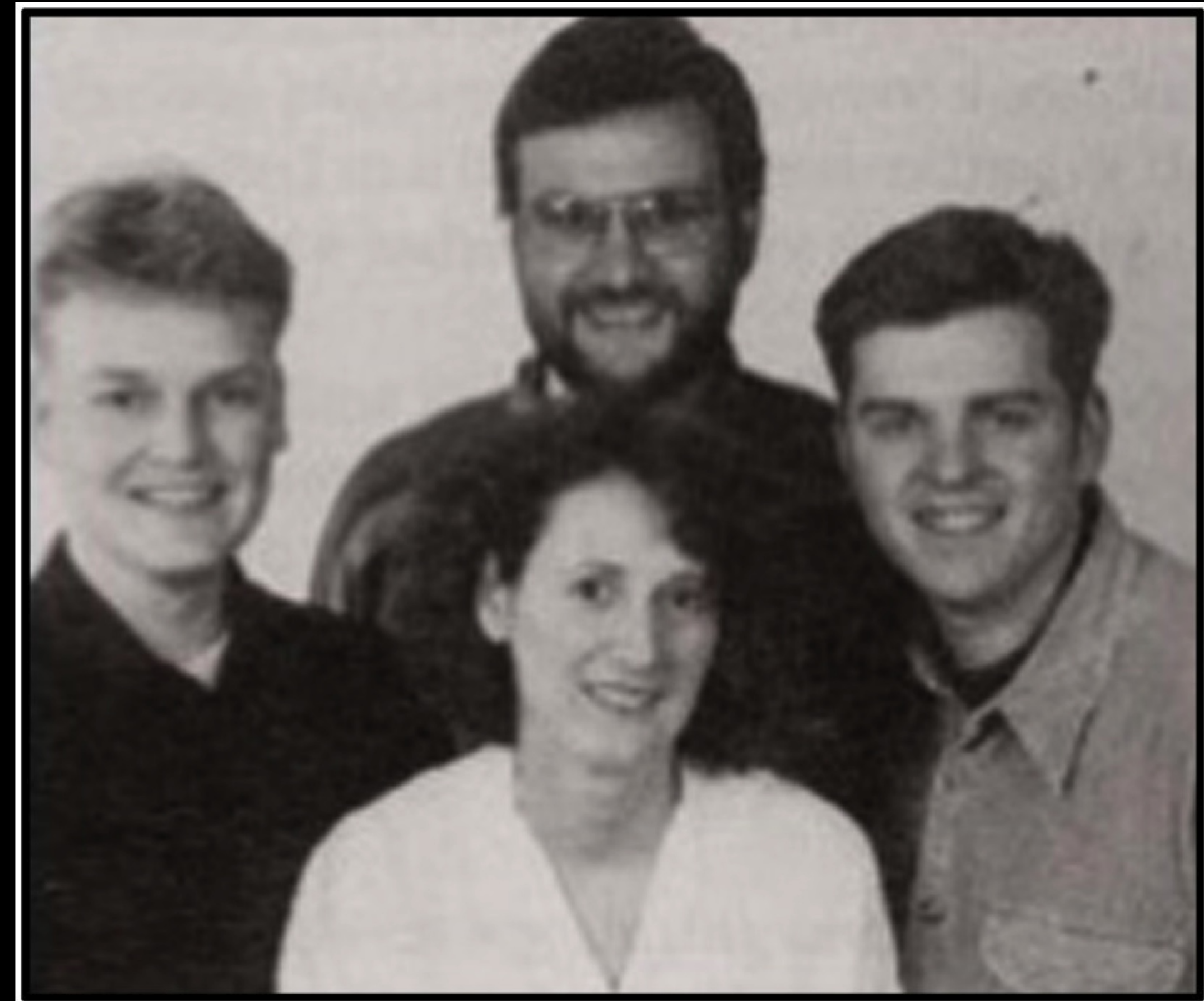
Tuesday, July 10, 2012